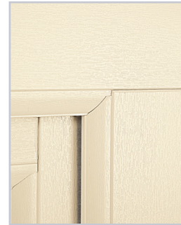
Colour and Texture