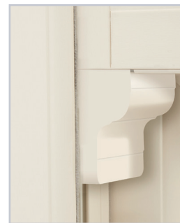
Sash Horns in 3 styles